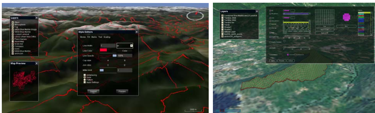
Figure 2. The Simplified (left) and Advanced (right) Style Editor Interface

A GUI component allows the user to simply select the relevant file on their file system and to specify the appropriate EPSG code or projection details. The file is sent to the central repository to an EJB which receives it and it automatically invokes a re-projection service made available by a further EJB. After this operation, which is completely transparent to the user, the data is finally stored, it is sent to the EJBs responsible for mapping and it finally becomes visible to the client. At the client side the image, which is received via WMS, becomes immediately visible behind the GUI, while at the server side this is passed to the component responsible for server-side caching.